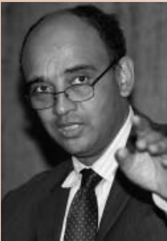
Kwame Anthony Appiah, Ph.D.

Laurance S. Rockefeller University Professor of Philosophy and the University Center for Human Values, Princeton University