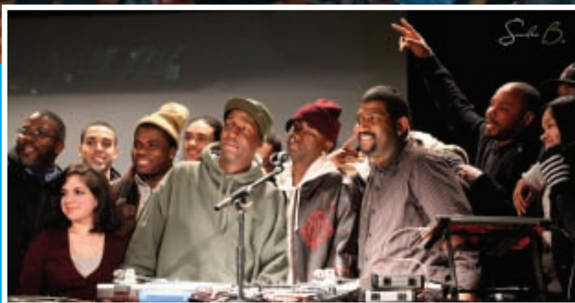
Photo at right: Rap legend Grandmaster Flash, front row, second from left, led a workshop for UX students entitled Up from the Streets, To Make the Beats: The Origins of Hip-Hop.