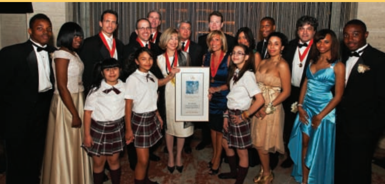
Photo at left: Elliott Management Corp. honorees with All Stars youth leaders at 2010 annual gala benefit at Lincoln Center.