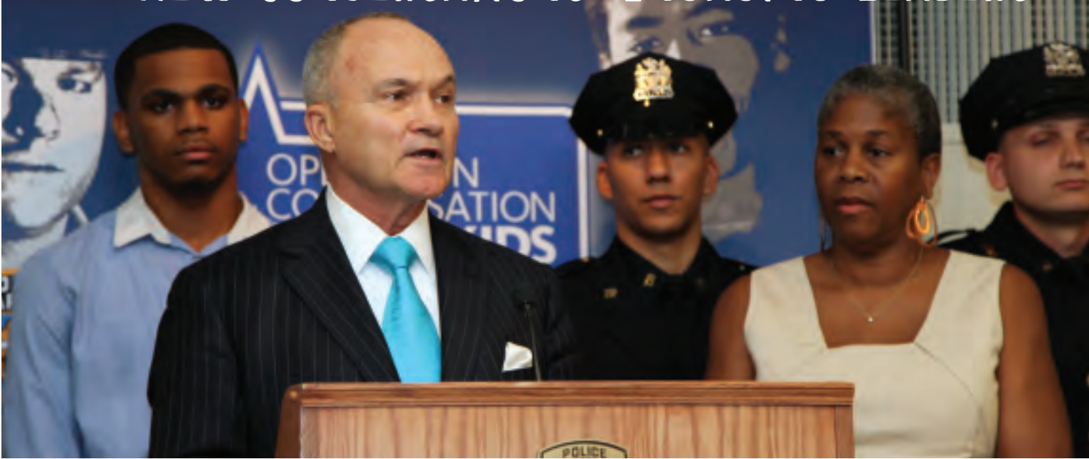
(Above) NYPD Commissioner Raymond Kelly and ASP co-founder Dr. Lenora Fulani held a news conference in Harlem on July 31, 2012 to discuss the breakthrough program and All Stars-NYPD partnership, Operation Conversation: Cops & Kids. Said Kelly, "I want to commend Dr. Fulani for...putting (Operation Conversation) together."