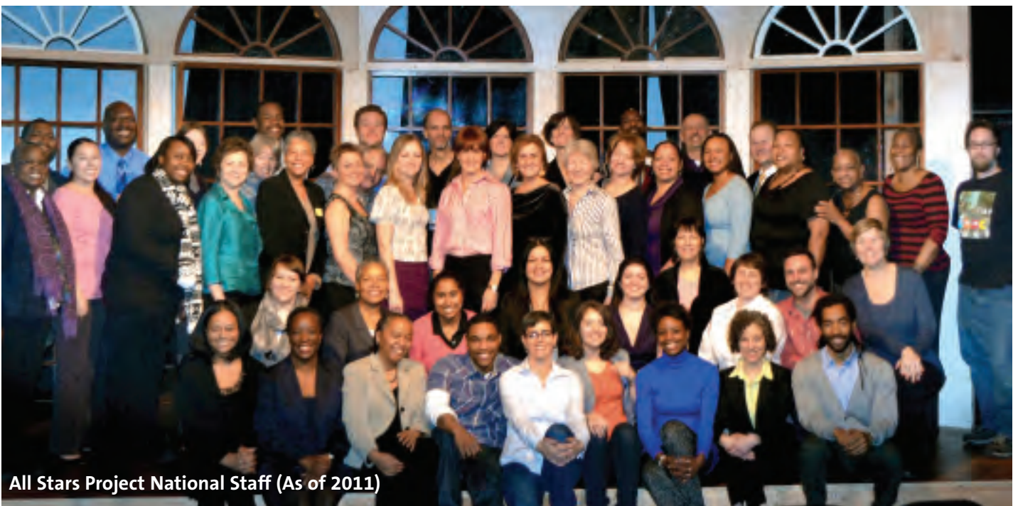
All Stars Project National Staff (As of 2011)