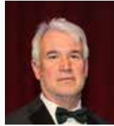
GEORGE GASCON SF District Attorney

"I am committed to repairing the harm in the lives of these young people rather than seeking to punish them. I regard the All Stars Project as an important ally in this effort. Their work with our most at risk youth is vital."