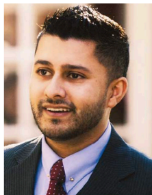
Raj Mukherji Assemblyman (D-Jersey City) State of New Jersey