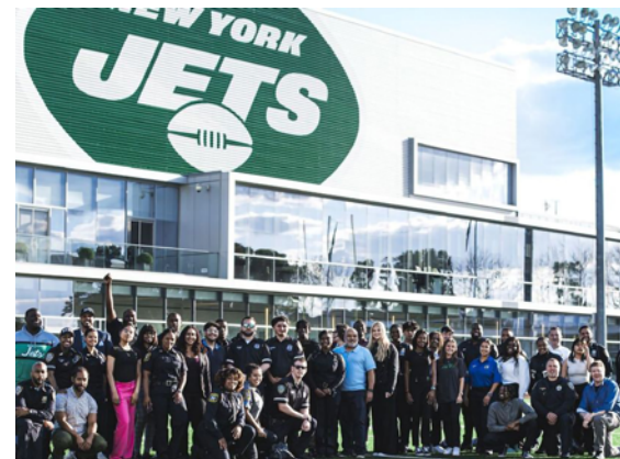
Operation Conversation: Cops & Kids

ASP has developed bridge-building initiatives focused on addressing social and racial divides in America. Through our award-winning police-community relations program, Cops & Kids, we have worked with over 5,000 NYPD and Newark Police officers to foster empathy and understanding between our youth and officers. In Operation Conversation, we impact corporate DEI efforts by helping employees develop new skills in appreciation, listening, and exercising their “curiosity muscles.” All our programs build diverse relationships that confront racism and promote racial healing in everyday life through the power of performance.